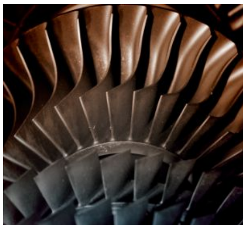
Nickel Alloy Turbine Blades

At its January 2012 meeting, the Consultative Committee of the Common Fund for Commodities approved a proposal submitted by ILZSG for a new project, "Transfer of Technology and Promotion of Demand – Zinc Die Casting in India". The project executing agency will be the International Zinc Association. The aim of the project is to improve die casting industry competitiveness, increase domestic consumption and the share of global casting market, increase jobs and enhance the economic importance of the die casting industry in India. The total cost of the project is $270,000 of which $110,000 will be provided by a grant from the CFC. Further information is available from curtis_stewart@ilzsg.org .